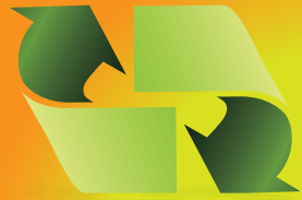
Renewable Energy/Energy Efficiency (RE/EE)