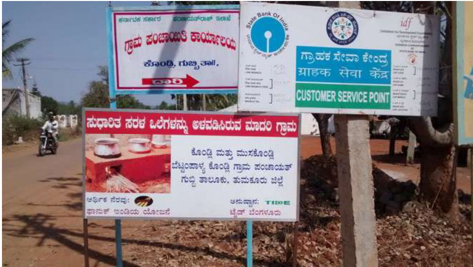
Figure 3: Smokeless village board