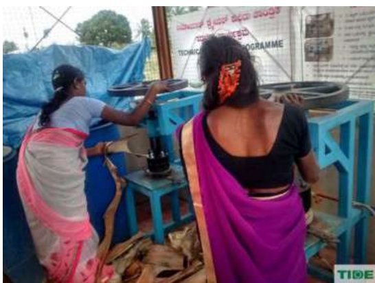
Women trying their hand at making Areca leaf sheath plates

Ragi, grown locally, was the second option selected. Products made from it like huri hittu and malt are in demand. Training began this month (March) for the women interested in pursuing this.