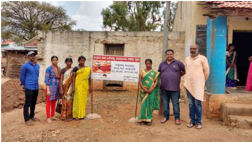
Figure 4: With women stove builders at Goddadahalli