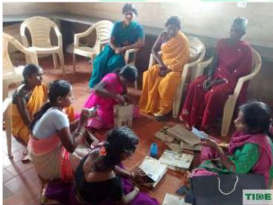
Women undergoing paper bag making training

The micro entrepreneurship kick started with the stove building program. So far five women have been trained and 50 stoves constructed. Women from the village were taken on an exposure visit to TIDE's Women Technology Park to meet and interact with entrepreneurs trained by TIDE and see various livelihood possibilities for themselves.