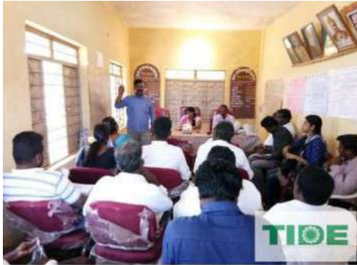
Meeting with Gram Panchayat Members

To ensure the success of the program it was important to first get the support of the Kondli Gram Panchayat. Several meetings were held to get a buy-in after which an MOU was signed to initiate capacity building of the Gram Panchayat focusing on Organization Development through interventions benefitting the community. This began with a baseline survey of villages. Information was gathered on each village. Goddadahatti was adopted as the model village. Focus discussions with youth, women and the elders in the village helped identify two key areas namely, livelihoods and drinking water security, which were