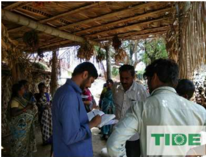
Collecting water samples

A comprehensive survey was done on water demand and supply in the village. Water tests carried out at three bore wells and in households across the village showed hardness above permissible limits. Water drawn from some locations also showed E Coli contamination. The village has access to water ATM installed by the state government 2 kms away. However, distance and other social issues prove to be a deterrent with residents preferring not to use the facility. TIDE has piloted home level filters for field testing. A community level water ATM has been identified as the best solution after evaluating various