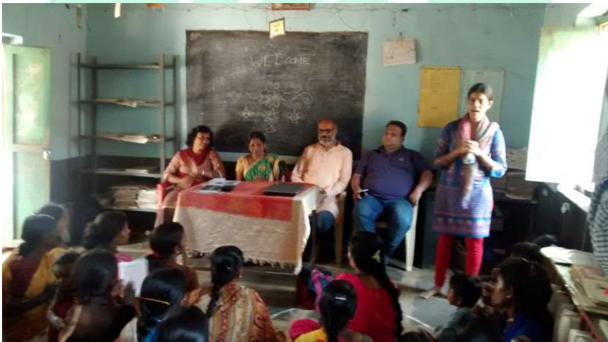
Figure 2: Team interacting with community

TIDE invited FANUC team to visit Goddadahatti village in Kondli Gram Panchayat, a three-hour drive from Bangalore, to see the Sarala stoves installed in homes. The team received a very warm welcome. The community was very appreciative of the initiative to make their village and homes smokeless. The team's one-on-one discussions with villagers and witnessing of the living conditions up close led them to believe that much could be done to bring about long term improvements in the lives of the people, especially the women, who lived there.