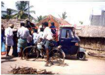
Mobile display of charaka stoves in a silk reeling cluster

silk reeling, TIDE undertook energy efficient stoves for silk three types of silk reeling the first demonstration unit of installed in a reeling unit Ramanagaram, Bangalore