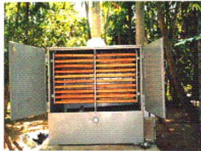
Pre-fabricated fish dryer

segments, the project the better quality of adopted in production supplied along with the staff and sales agents explained about the enterprises participated