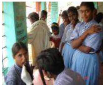
School children at the dental camp

fluorosis was more older generation of level of fluoride in past 3-4 years. An village on the