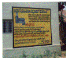
Wall painting as a part of promotional activities

exhibition, display appointment of place,