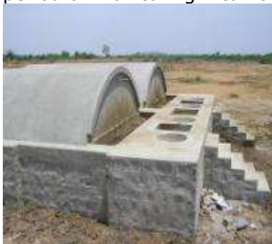
Bioreactor at Raichur

During the current year TIDE operated the plant for three months during which period data about the plant performance and waste inflows into the site were collected. It was observed that during the period of monitoring 1 ton of unsegregated waste was coming to the site every day. After segregation at the site, 0.5 tons of the organic component was fed to the bioreactor which was sufficient for feeding only one module of the bioreactor. Data on gas generation showed that the gas production was 30 cum/day which is as per expectations considering that the bioreactor was operating at 50% of its designed capacity. The compost yard was also operated for three months and compost produced.