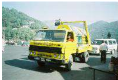
Waste being moved to disposal site

In Hilly towns, houses are constructed on hill slopes and consequently the access to individual houses is not good. Significant littering is observed and hill slopes laced with plastic appear unsightly. Depending on the structure of the town few roads, which are arterials, cannot be used during peak traffic timing. Further the road widths are also lower. The nature of economic