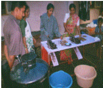
Women being trained in cashew cutting in the Pallikere training centre

With the assistance of Kudumbashree Poverty Alleviation Mission of the Government of Kerala, five Gram Panchayats were identified. The criterion for identifying these Panchayats was the location of cashew plantations in these areas. Meetings were held with the Village Extension Officers and Presidents of the Community Development Scheme of these Panchayats, who organized meetings with Neighbourhood Help Groups (NHG). The groups were taken to Amrutha Cashew Unit (successful cashew processing SHG developed by TIDE during 2004) to provide exposure to all enterprise-related activities. The three groups currently carrying out cashew processing are (a) Prateeksha Swa Sahaya Sangam, Nellikutty village, Kannur district. (b) Prateeksha NHG, Pallikere, Kasargod and (c) Sreyas NHG.