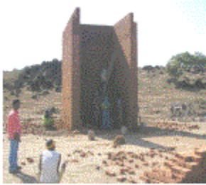
Construction of energy efficient brick kiln

year the individuals trained in constructing household cooking stoves have constructed about 55 Sarala stoves and 9 water heating stoves. Various market development activities such as ♦ Mobile exhibition, door to door campaigns, advertisements in local news papers and meetings at villages were conducted to create awareness about the stove and to obtain orders for constructing the stove. The trainees were encouraged to undertake promotional activities such as door-to-door campaigns on their own and to install stoves whenever the order exists.