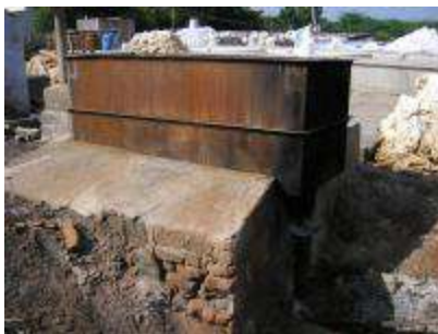
A typical bleaching stove

The combustion devices (stoves) in bleaching and