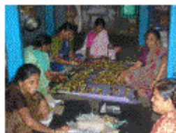
Fig processing undertaken by womens' group

supporting this standardizing the the dried fig has