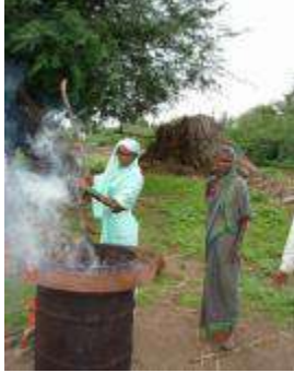
Women producing charcoal

A group of four women was identified in Jodkurli village in Chikodi district of Belgaum taluk and trained. Since harvesting Prosopis twigs is not easy because of the thorns, a wood supplier was identified to harvest and cut the twigs to the required size. An entrepreneur was identified whose role would be to procure the wood and give it to the trained women, who would then produce charcoal. The entrepreneur would market the charcoal. The enterprise was demonstrated to the entrepreneur by TIDE, before handing it over. The enterprise is picking up slowly. In the meantime, efforts are on to identify one more group in Belgaum district to train in this activity. Efforts are also on to identify one more group in Belgaum to produce char from bagasse, as it is perceived that there is a large market for charcoal in the area.