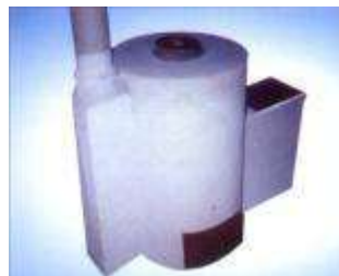
Single-pan areca cooking stove

undertaken with The project setting secondary data while information collected