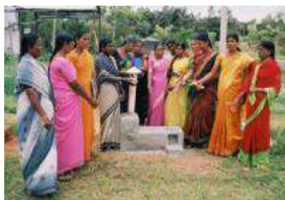
Group of master trainers with a stove built by them

stove builders as master initially called 'Training of training of Master trainers, emphasis on technical skills. Besides, most of the The women who attended