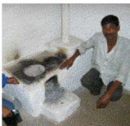
Sarala stove constructed by the trainer

Madhya Pradesh: The following environment friendly income generation activities were undertaken under the project a. Installation of Sarala household cooking stoves and water heating stoves and b. Installation of improved energy efficient brick kiln