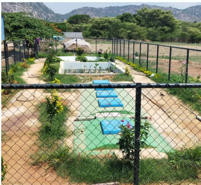
Decentralized Waste Water Treatment System (DEWATS)

-R Chakravarthy, Principal, JNV Rural, Doddaballapur, Bangalore Rural District