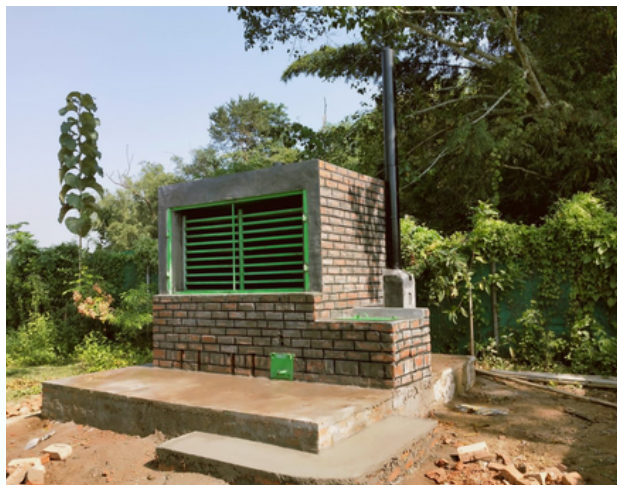
Biomass Dryer in Assam

Climate Resilience – We empower students and women with the right tools and resources to combat the impacts of climate change, build resilience and a sustainable future.