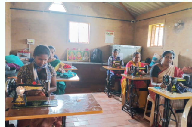
Tailoring training for rural women's at WTP

TIDE goes beyond building resilience by providing skills training and linkages for income generation, focusing on climate mitigating measures like areca leaf sheath quality. In FY 21-22, 3000 rural women and youth were made aware of livelihood opportunities, with 1600 receiving skill training. TIDE empowered 750 women to generate their first-time income, resulting in INR 1.5 CR income by trained rural entrepreneurs. Their flagship program, "Queens," trained 100 women in leadership. TIDE offers skilling in food, non-food artisanal, and digital entrepreneurship, using a unique placement center model for home-based and industrial job opportunities. They also provide post-training support for enterprise development. TIDE collaborates with academic institutions, skilled manpower, financial institutions, and state programs to strengthen community resilience.