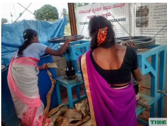
Women trying their hand at making Areca leaf sheath plates

Ragi, grown locally, was the second option selected. Products made from it like huri hittu and malt are in demand. Training began this month (March) for the women interested in pursuing this.