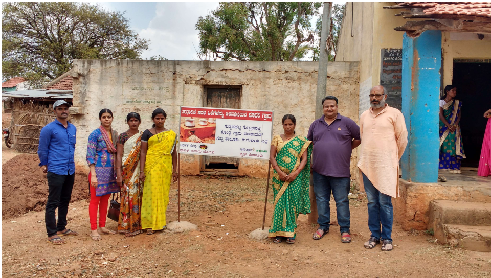
Figure 4: With women stove builders at Goddadahalli