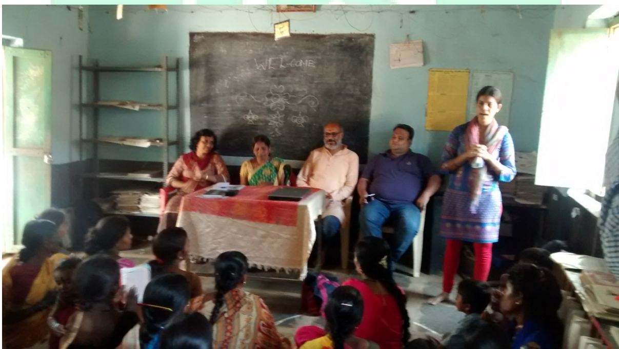
Figure 2: Team interacting with community

TIDE invited FANUC team to visit Goddadahatti village in Kondli Gram Panchayat, a three-hour drive from Bangalore, to see the Sarala stoves installed in homes. The team received a very warm welcome. The community was very appreciative of the initiative to make their village and homes smokeless. The team's one-on-one discussions with villagers and witnessing of the living conditions up close led them to believe that much could be done to bring about long term improvements in the lives of the people, especially the women, who lived there.