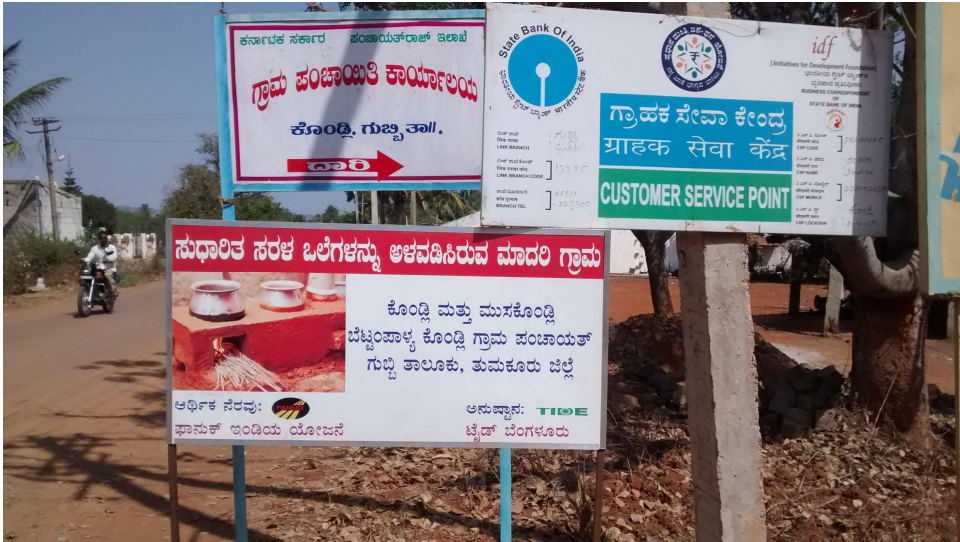
Figure 3: Smokeless village board