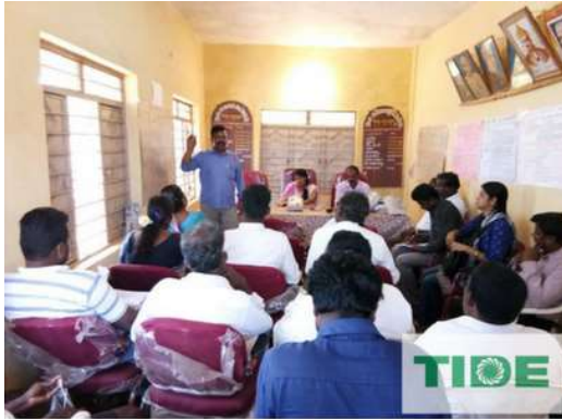
Meeting with Gram Panchayat Members

To ensure the success of the program it was important to first get the support of the Kondli Gram Panchayat. Several meetings were held to get a buy-in after which an MOU was signed to initiate capacity building of the Gram Panchayat focusing on Organization Development through interventions benefitting the community. This began with a baseline survey of villages. Information was gathered on each village. Goddadahatti was adopted as the model village. Focus discussions with youth, women and the elders in the village helped identify two key areas namely, livelihoods and drinking water security, which were