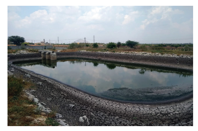
Oxidation pond in the STP

Chintamani town has a centralised sewerage system installed within the municipal area. As per the consultation with the CMC officials and physical survey, around 98% of the population is using the sewerage system (T1A1C1) for disposing the waste water, which is connected to the sewage treatment plant (STP).