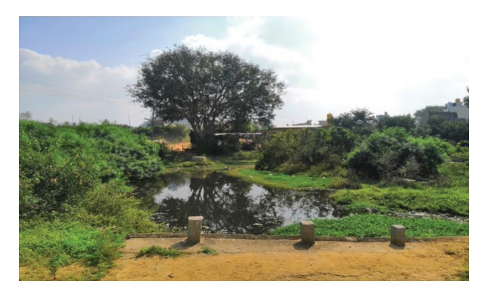
Final discharge of waste water from sewer network

Around 2% population is readily dependent on onsite sanitation system consisting of 0.1% of toilets connected to septic tank (T1A2C9) installed at the government quarters, 1.7% of fully lined tank (sealed), (T1A3C9) and 0.2% of lined tanks with impermeable walls and open bottom (T1A4C9) at ward number 8 and 9 (based on field survey and community engagement).