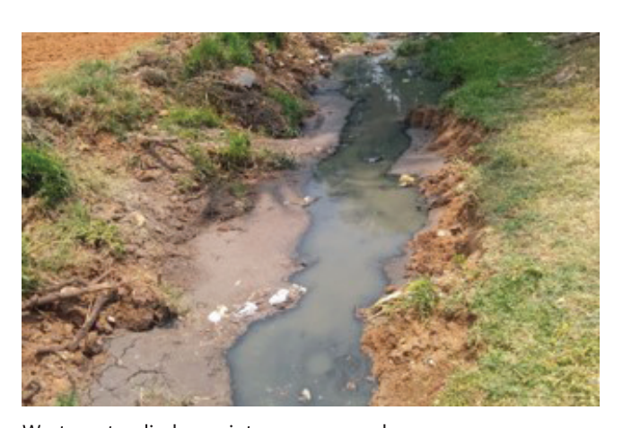
Waste water discharge into open ground

The Sewage Treatment Plant (STP) located at Gopasandra tank is of the design capacity of 2 MLD. Due to limited capacity, around 58% of the wastewater is directly disposed into Nekkundi lake, leading to the eutrophication of the lake.